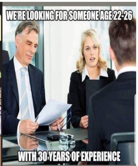
Job interview in 2022 for university grads